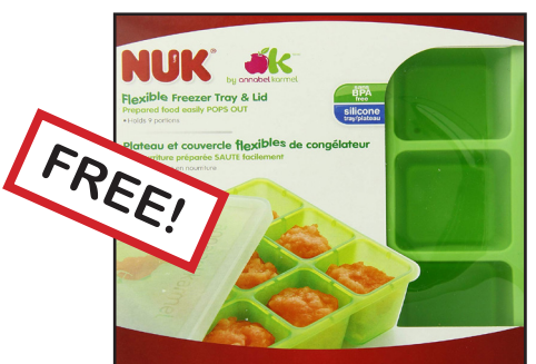
Limit: one freezer tray per daycare

There will be interesting group activities and a chance to ask questions. This training is optional to attend. We hope to see you at the training most convenient to you.